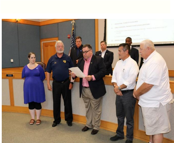
Goose Creek Mayor Proclaims June 17 – 23 2018 Amateur Radio Week in Goose Creek

“Electricity is really just organized lightning.” — George Carlin